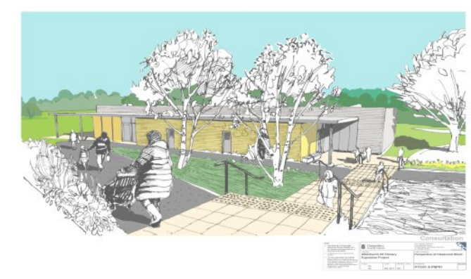
Perspective of new classroom block